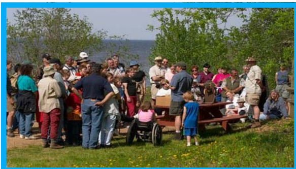
We hope to see everyone back again next year. This time bring a friend!

Next year's festival promises to be bigger and better than ever with the opening of the brand new Boreal Centre for Bird Conservation at the 11th Annual Songbird Festival. We hope to see you there for all of the fun and excitement of the 11th Annual Songbird Festival .