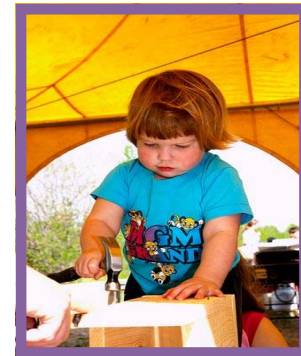
The Bird House Building was a huge HIT!