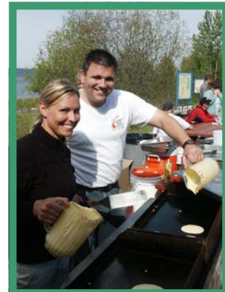
Everyone enjoyed the Pancake Breakfast!