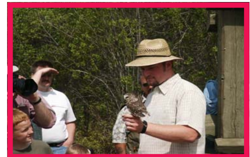
Thank you Beaverhill Bird Observatory for bringing your beautiful Saw-whet Owl for a visit.